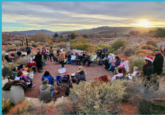
Celebratory Drum Circle

Center for Spiritual Living St George Events and Information