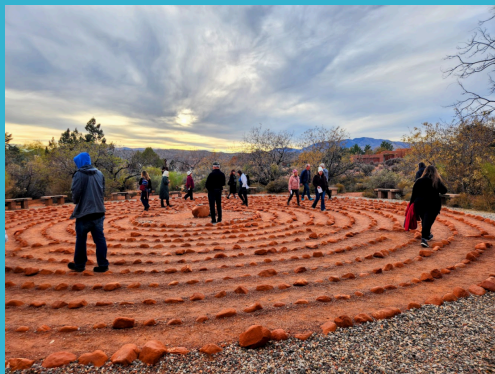
Desert Rose Labyrinth Walk

Drums, rattles, and various other instruments provided soothing rhythms as the sun set dramatically over the surrounding desert landscape. Under a spectacular winter sky, it was an ethereal experience for all. We welcomed many new people including several Kayenta residents. It was a great step in expanding our Center's gatherings and to continue to introduce CSL to the greater community.