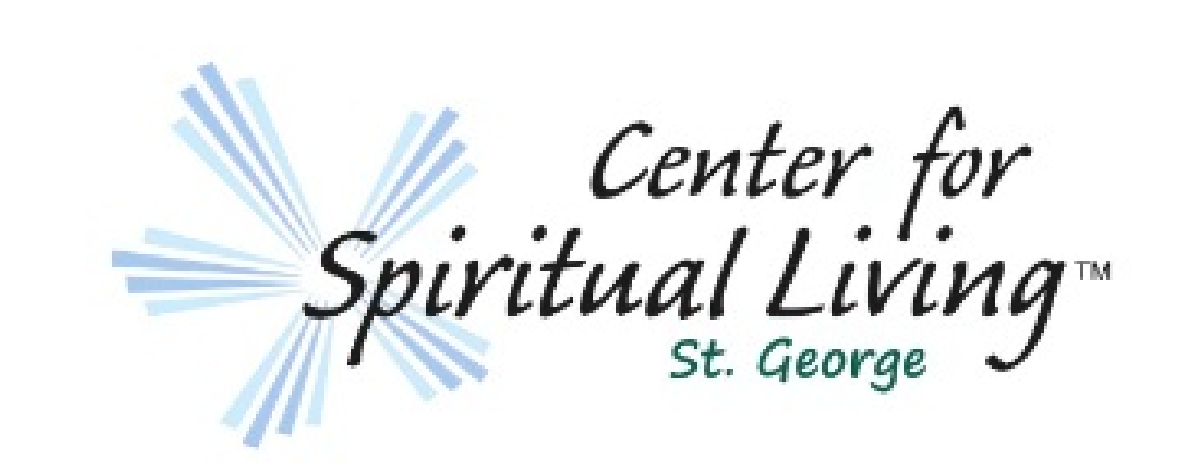
We are an open, loving, and inclusive community that supports thinking creatively and living a deeply spiritual life.